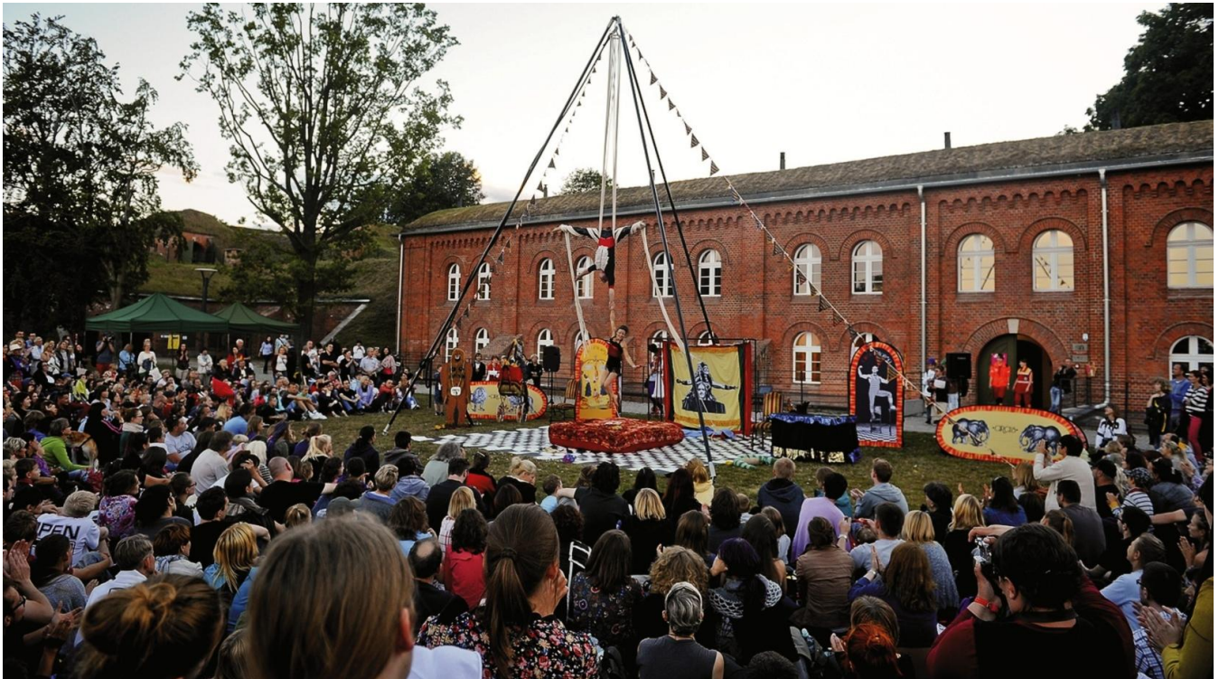
ETA Festival, Gdansk, Poland 2014

We are equipped with a sound system for about 500 people. For bigger audience, extra soundsystem is required.